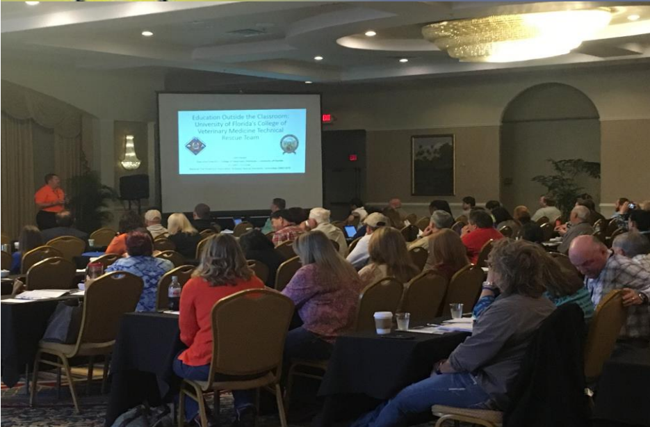
Photo: SART Planning Meeting, March 28-30, 2017