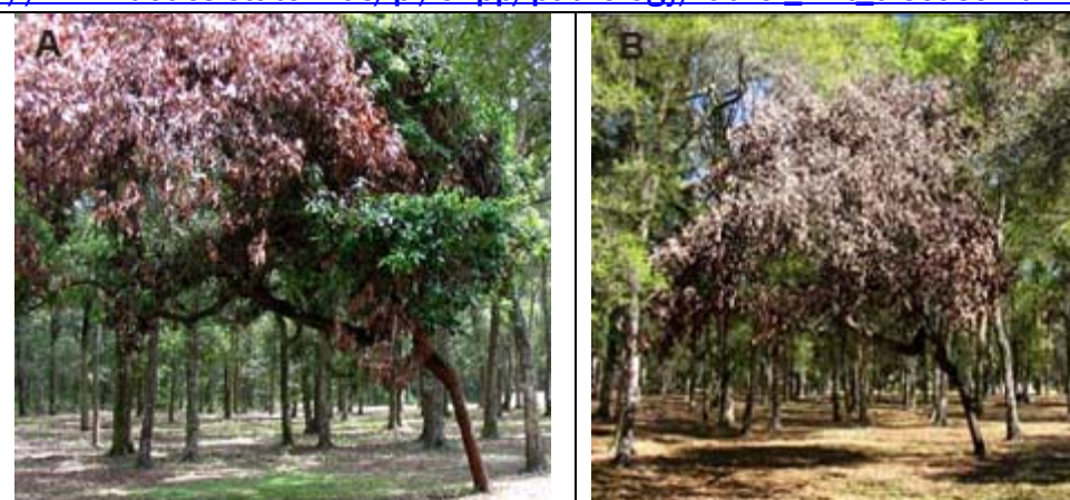
Wilt symptoms of redbay attacked by the beetle and infected with laurel wilt. A) Sections of crown turning purple to red. B) Same tree eight months later (May 2006).

1. Watch for signs on your trees. For photos and information visit <a href="http://www.doacs.state.fl.us/pi/enpp/pathology/laurel_wilt_disease.html">http://www.doacs.state.fl.us/pi/enpp/pathology/laurel_wilt_disease.html</a>.