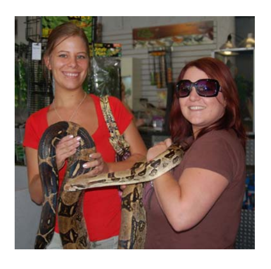
SART thanks Pangaea Pets of Gainesville for allowing us to take photos of these young women and the red-tail python.

You are tramping along surveying damage after a storm – it's hot and humid, electricity is out, supplies are short, fallen trees lie across the road, you are tired and thirsty – and Bingo ! A huge snake – a python or boa constrictor, but way too large to be a native Florida snake – slithers out of the grass in front of you. What do you do?