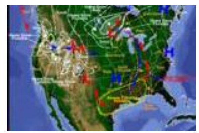
Current Storm Watch Find national weather and climate long-term and short-term info.

Owners should review several plans, many of which are available online, and decide on what works best for them.