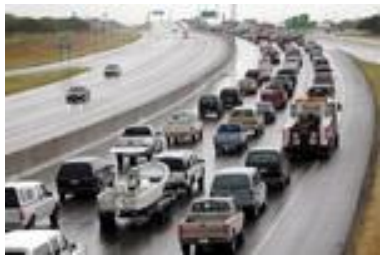
Are You Ready? Guide Prepare yourself and your loved ones for all types of hazards.