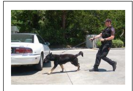
A Florida Highway Patrol trooper and his canine check an automobile for drugs.

Officially created with 60 sworn officers in 1939, FHP is part of the Department of Highway Safety and Motor Vehicles. Officers are called State Troopers, not Highway Patrolman, as in some states. The function of the FHP is to ensure the safety of State Roads, U.S. Highways and Interstates.