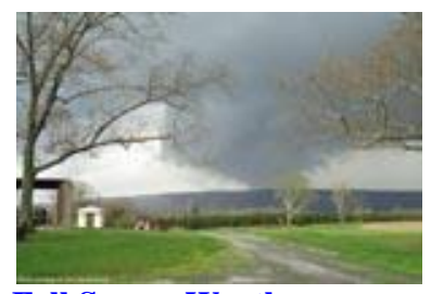
<u>Fall Severe Weather</u> Take steps to protect your family and property now.

long, how transportation is to be handled, who pays for the extra staffing needed, etc. Pet shops, stables, kennels and any business whose primary inventory is the kind that breathes could benefit greatly from this kind of agreement.