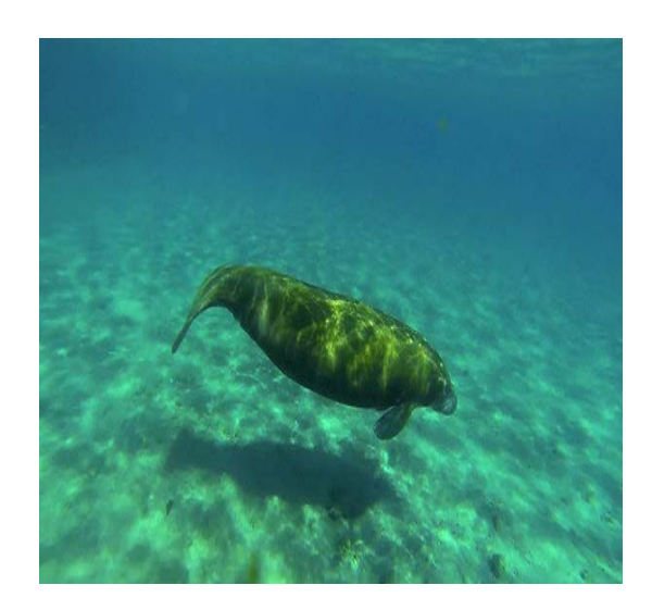
Manatees, endangered and reeling from an unexplained string of deaths in Florida's east coast rivers, have died in record numbers from a toxic red algae bloom that appears each year off the west coast, say state officials.

Red tide is mostly a problem on the western and southwestern shores of Florida. It releases a neurotoxin that's lethal to manatees. "If you're a dog sniffing it, you wake up with a hangover the next day. If you ingest it and you're a manatee in the water, you end up drowning," Bonde says. "On the brighter side, there appear to be a lot of manatees around." The statewide "guesstimate" is at least 5,000.