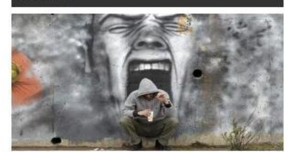
How Greece went bust

The long-running struggle between wayward Greece and the megalithic European Union is a relationship beset by blunders and serial brinkmanship. Special Report » | Factbox: Who Greece owes »