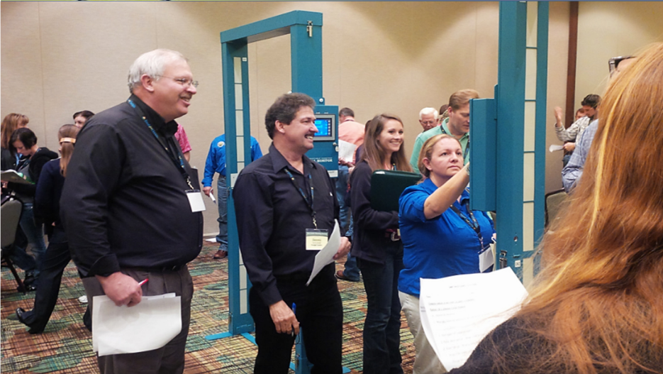
SART members engaging in a radiological exercise during the 2015 Planning Meeting.

NEWSLETTER OF THE FLORIDA STATE AGRICULTURAL RESPONSE TEAM