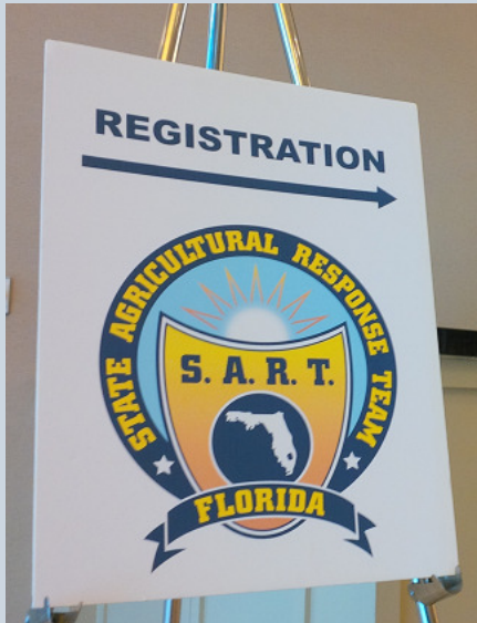
148 members attended the 2015 SART Planning Meeting.

"The partnership between agencies is critical." That theme would continue over the remaining two days of the assembly, which ended on January 14.