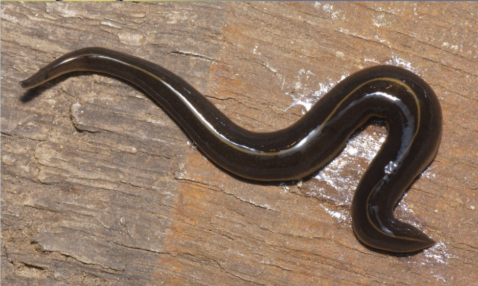
Platydemus manokwari , also known as the New Guinea flatworm, is a species of large predatory land flatworm.