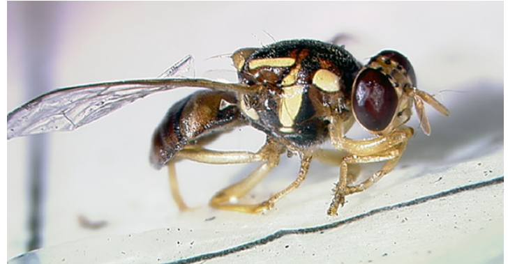
Male Guava Fruit Fly, above.

The guava fruit fly has been trapped several times in Florida since 1999, but it has not become established. It attacks many of Florida's fruit and vegetable varieties including guava, peach, mango, fig, date, tropical almond, sapodilla, roseapple, jujube, castor bean and sandalwood.