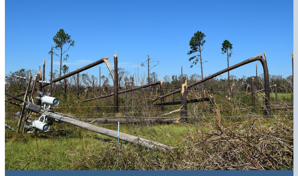
Hurricane Michael was the first Category 5 hurricane to strike the contiguous United States since Andrew in 1992.

Newsletter of the Florida State Agricultural Response Team