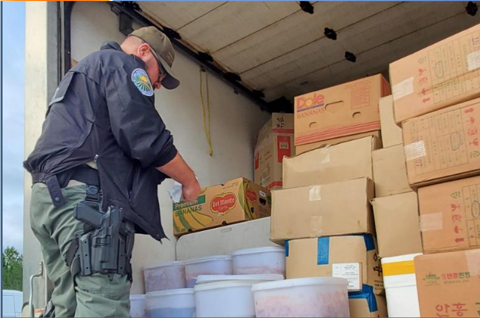
An Ag Law officer inspects a box truck on Interstate 95.

Newsletter of the Florida State Agricultural Response Team