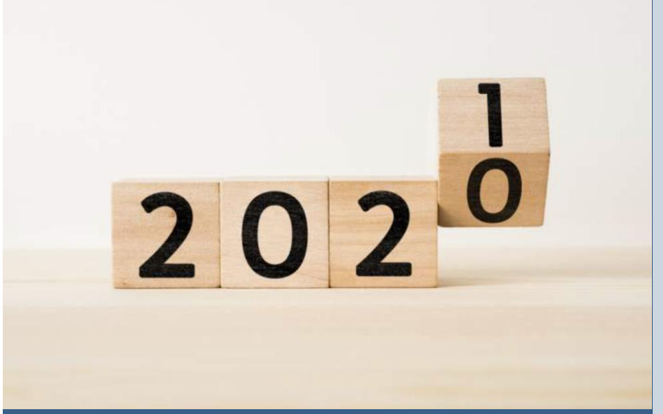
2020... A year for the history books! SART looks back at our accomplishments.

Newsletter of the Florida State Agricultural Response Team