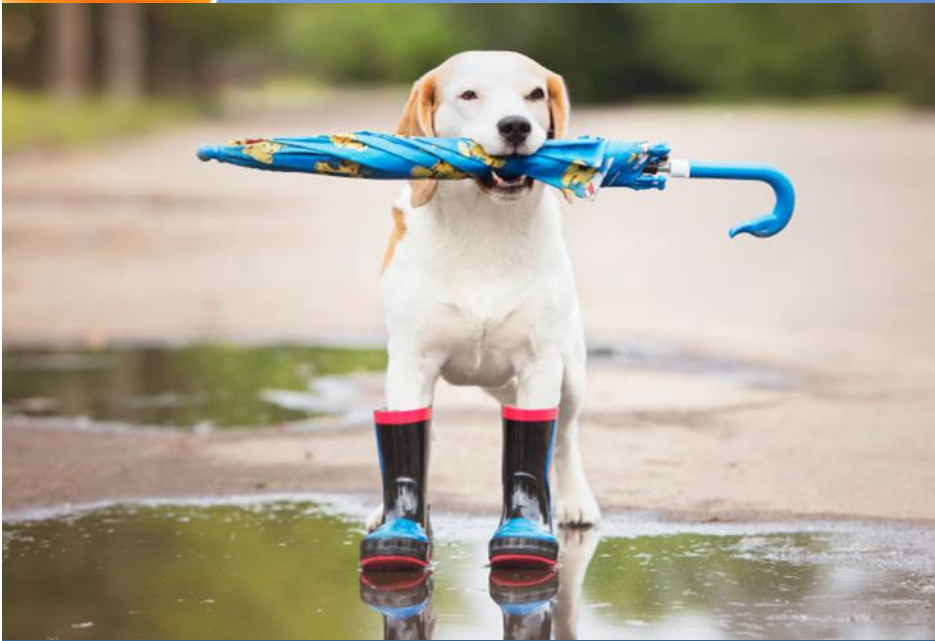
Hurricane Season kicks off on June 1. Are you and your pets prepared?

Newsletter of the Florida State Agricultural Response Team