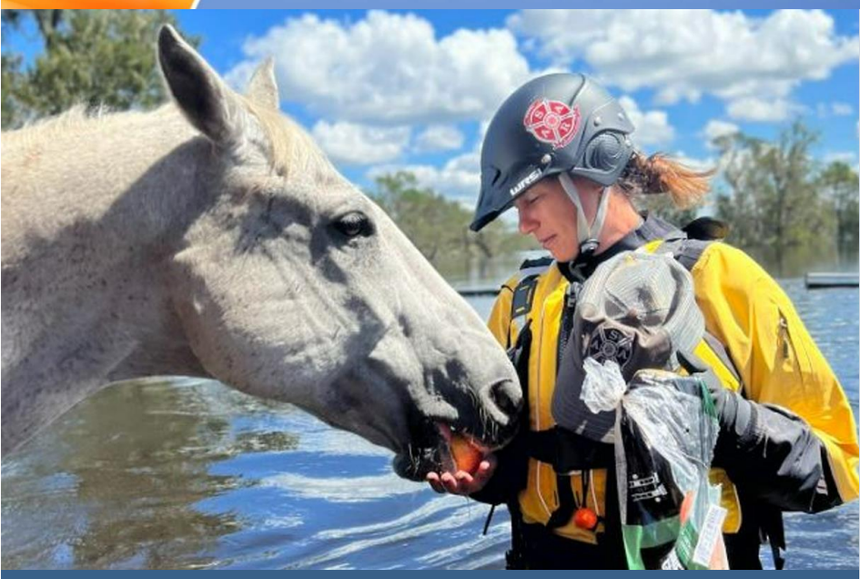
An ESF 17 first responder provides aid to a horse following Hurricane Ian.

Newsletter of the Florida State Agricultural Response Team