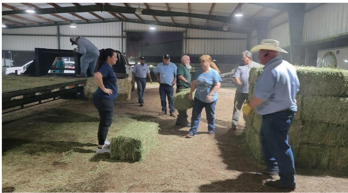
Above: The ESF 17 IMT Donation Staging Area is a major operation of our IMT response; it puts animal and ag resources directly in the hands of our citizens and producers in critical need.