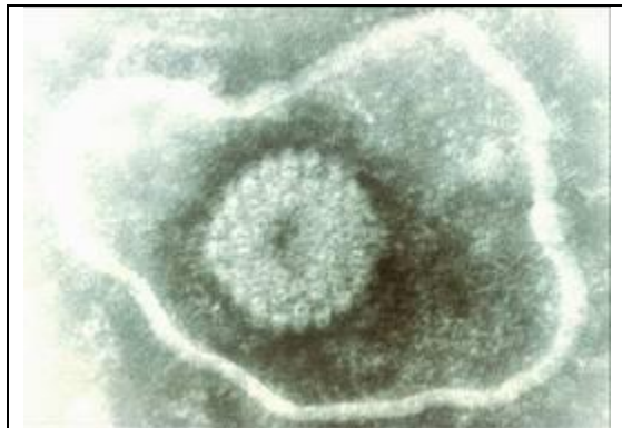
EHV - Equine Herpes Virus or Rhinopneumonitis. There are 5 known strains of EHV. EHV-1 is associated with viral abortion and neurologic disease. This is a DNA virus and can remain dormant in neural tissue much like human Herpes viruses and may then become active during periods of stress.

Recommendations for horses shown at HITS since February 5 include close monitoring of animals, reporting of fevers greater than 101.5 F (38.6 C) and strict bio-security measures for at least 21 days after departure from HITS.