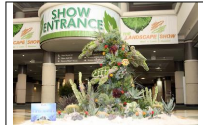
The Landscape Show 2012.

For information or registration, go to the FNGLA web site at www.fn gla.org .